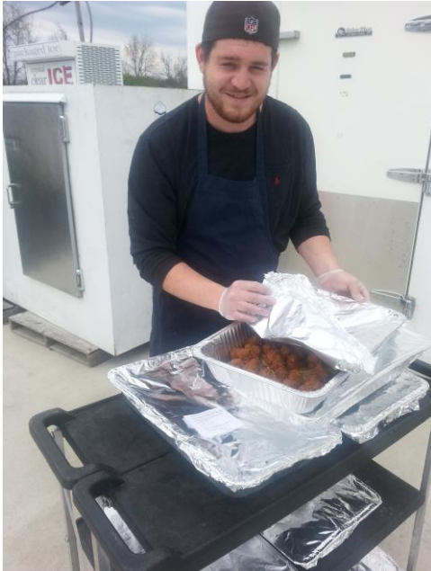
High Point Catering donates food left from a Manna fundraising event.

You can make a real difference in Montgomery County when hiring a caterer for your events. Community Food Rescue (CFR) provides an easy way to share unused catered food with people who are food insecure—including approximately 70,000 residents in Montgomery County. Donating surplus food also prevents good food from going to waste.